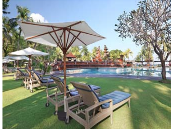
Pool Side Chair & Garden