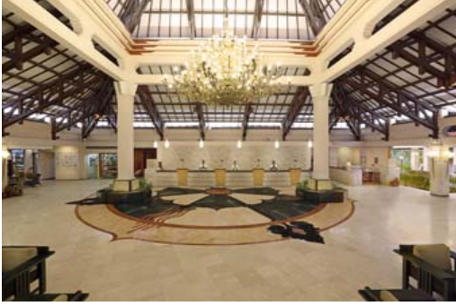
The Grand Lobby