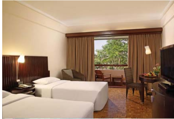
Deluxe Room Twin