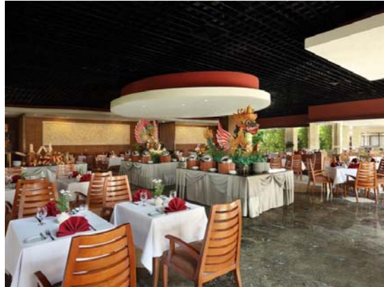
La Brasserie Restaurant