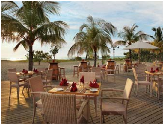
The Warf Restaurant Deck